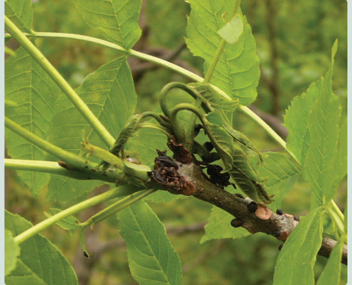
An ash tree infected with Chalara fraxinea , sometimes known as Hymenoscyphus pseudoalbidus (which describes another life stage).

Ash dieback is a disease of ash trees caused by the fungus Chalara fraxinea . The disease causes leaf loss and crown dieback in affected trees and often leads to tree death. Ash trees showing symptoms of Chalara fraxinea are now widespread across Europe and in 2012 it was detected for the first time in Britain – initially in a consignment of infected trees sent from the Netherlands to a nursery in the south of England, but later in trees planted in the natural environment. Surveys have now confirmed the presence of ash dieback disease at more than 150 locations in England and Scotland, including established woodlands. Chalara fraxinea is being treated as a quarantine pest under national emergency measures; it is important that suspected cases of the disease are reported.